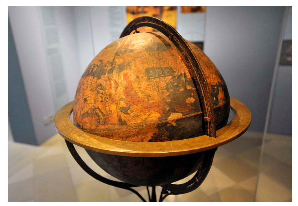
Figure 1. Behaim globe in the exhibition of the Germanic National Museum, Nuremberg.

With a diameter of 50 cm the globe is rather large, exhibiting an image of the earth at the turn to the modern age, which is primarily affected by Ptolemaic cartography (Fig. 1), but it also carries iconographic elements of portulans (sea charts) and of medieval universal cartography. First of all, the globe was put on display at a prominent place in the Nuremberg city hall and it got a new metal stand with an engraved horizon in 1510. In 1493, Martin Behaim returned to Portugal and he died in Lissabon in 1507. Whereas the final financial account on the globe of 1494 indicates clearly which craftsmen were involved in its making (Petz 1886), the Behaim globe must be regarded as a joint achievement of the Nuremberg humanist circle. It is an early masterpiece of many kinds of scientific and technological achievements, establishing the intellectual and economic leadership of Nuremberg in late medieval Germany.