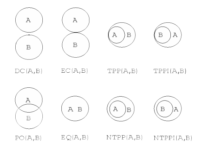
Figure 4. Topological relations of Region Connection Calculus RCC8. Abbreviations: DC = disconnected from, EC = externally connected to, PO = partially overlaps, EQ = is identical with, TPP = tangential proper part of, NTTP = nontangential proper part of.

Three elements are required for relations of direction or orientation: A primary object, a reference object, and a reference system. A reference system can either be extrinsic such as a given coordinate system or a system of rhumb lines on a portulan, or deictic.